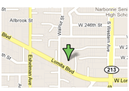
Lomita Veteran's Hall, 1865 Lomita Blvd, Lomita

Members, friends and colleagues are invited to attend our monthly meetings. The $35 annual membership dues entitle you to receive this monthly newsletter by mail or online, plus many more benefits (page 8). To become a member or get more info please check our website.