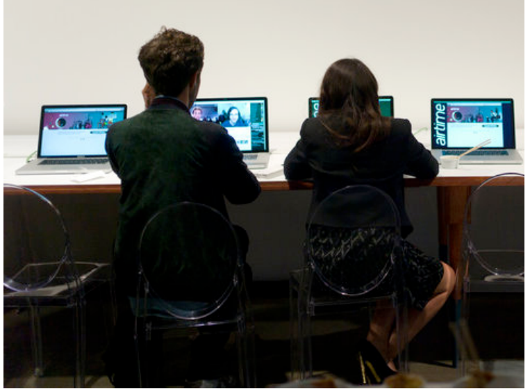
Users try out the Airtime video chat service. The founders hope to overcome problems that have set back well-known competitors.