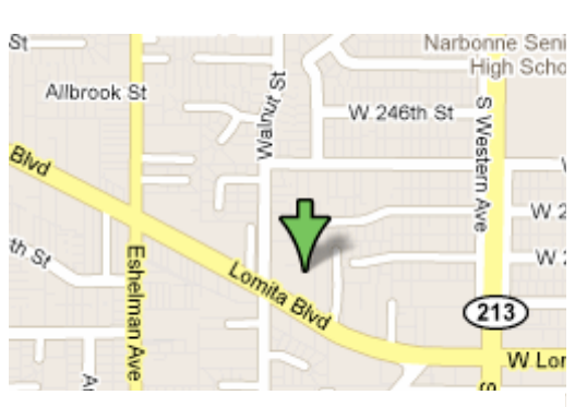
Lomita Veteran's Hall, 1865 Lomita Blvd, Lomita

Members, friends and colleagues are invited to attend our monthly meetings. The $35 annual membership dues entitle you to receive this monthly newsletter by mail or online, plus many more benefits (page 8). To become a member or get more info please check our website.