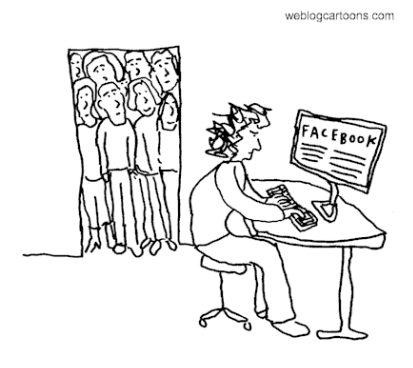
I AM TRYING TO ADD MORE FRIENDS